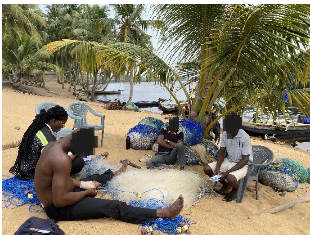
Figures 4. Socioeconomic implications

Sanitation infrastructure has also been devastated, with extreme weather events destroying toilet facilities and forcing residents to practice open defecation. These challenges have adversely affected sanitation, hygiene, and