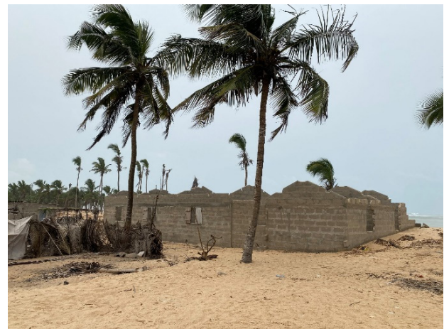
Figure 3. Destroyed classroom and sanitary facilities