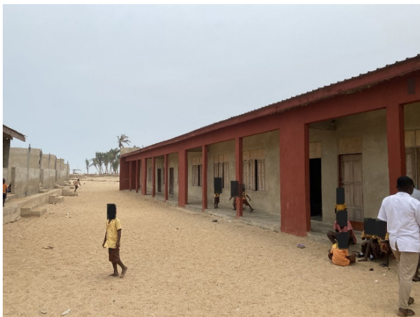
Figure 2. Destroyed classrooms

The lack of reliable water infrastructure and accessibility as well as the absence of hand-washing facilities are significant concerns in Fuveme, particularly among children in the school as lamented by a head teacher. The lack of accessible facilities, such as hand-washing facilities, can compromise hygiene practices and increase the risk of infections. 22