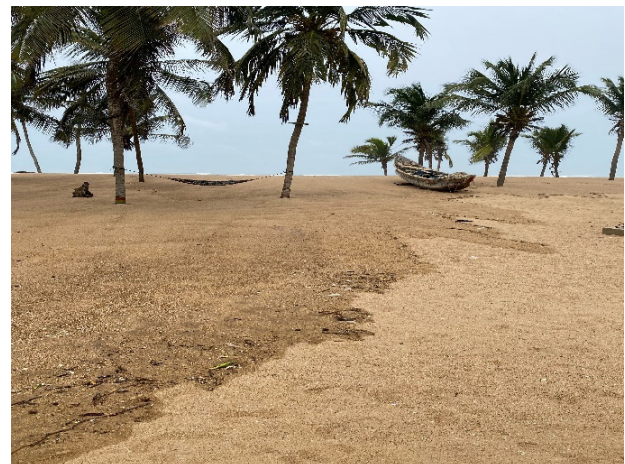
Figures 5. Climate action implications at the coast of climate action